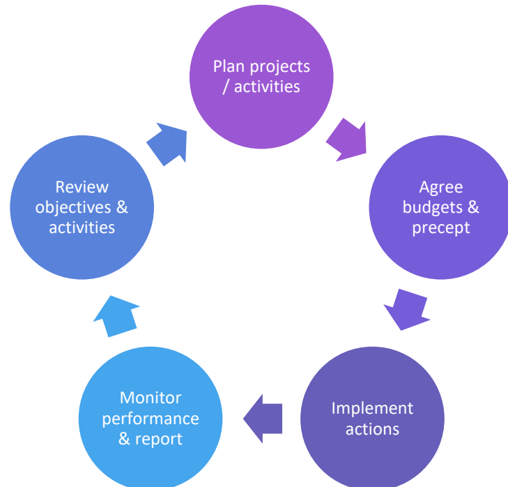
Fig 3: Plan/Budget/Implement/Monitor/Review Cycle: