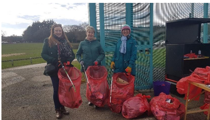
Eirias Park Litter Pick by Volunteers