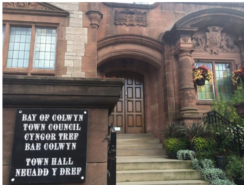
The Town Hall (Former Magistrate's Court), Rhiw Road, Colwyn Bay

You can also find us on Facebook, Instagram or Twitter – search for 'Bay of Colwyn Town Council'. Alternatively, please e-mail us at: info@colwyn-tc.gov.uk , call us on 01492 532248, or visit us at the Town Hall, Rhiw Road, Colwyn Bay (adjacent to St Paul's Church).